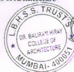
Managing Trustee Dr. Baliram Hiray College of

Dr. Baliram Hiray College of Architecture Architecture